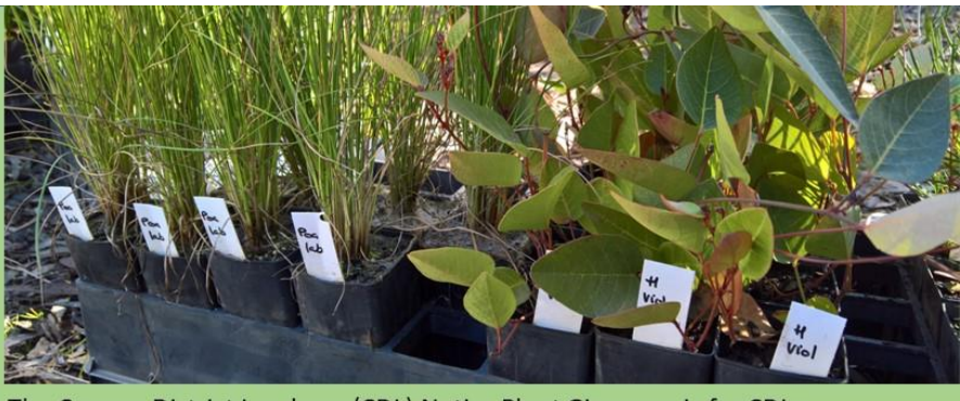
The Corowa District Landcare (CDL) Native Plant Giveaway is for CDL members and Federation Region residents only.

Plant pre-orders are required. All orders need to be received by Friday 30th June 2023. Please CLICK HERE or use QR Code to order