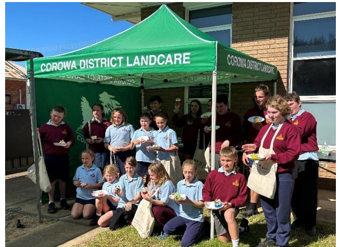
Oaklands Central School students with their decorated cupcakes