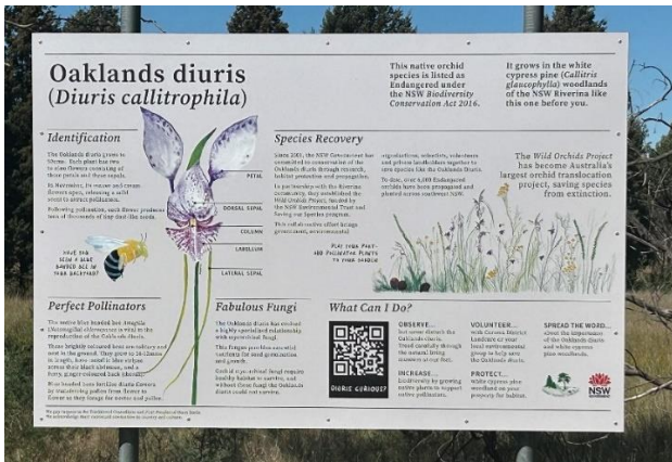
New signage installed