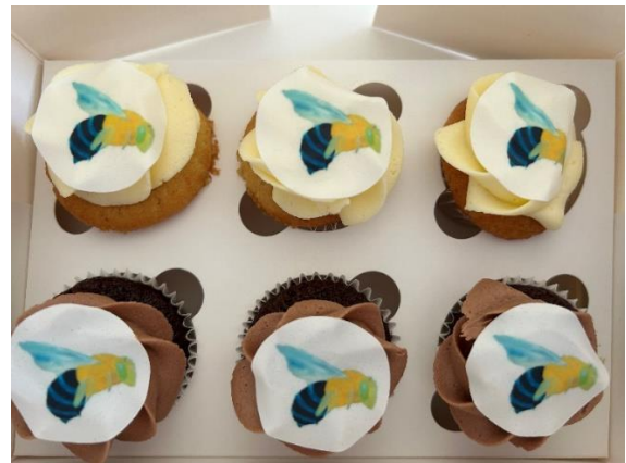
Blue banded bee cupcakes