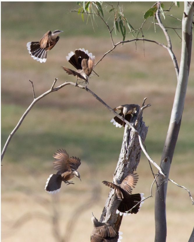
Grey-crowned babbblers.